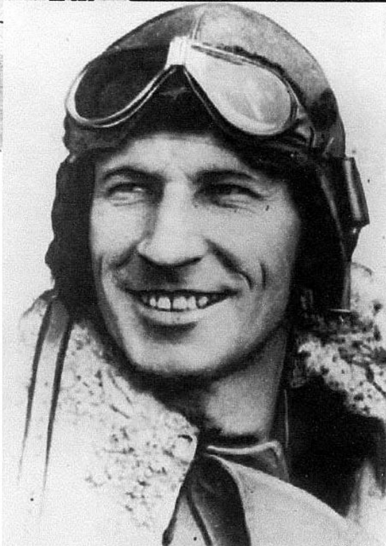
Kingsford Smith arriving at London on the 16 th December 1931 in the Southern Star after rescued the mail at Alor Setar.