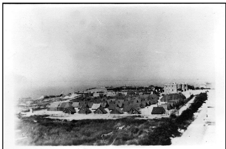
POW Camp, Pembroke Ranges, St. Andrews, MALTA 1942